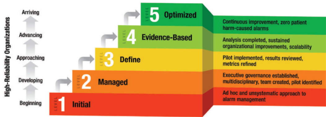
Figure 2. Clinical Alarm Capability Maturity Model

provider. The current policy comes from governance (level 2). Results from a pilot on a general care floor may cause leadership to revisit this policy in order to achieve higher levels of capability performance.