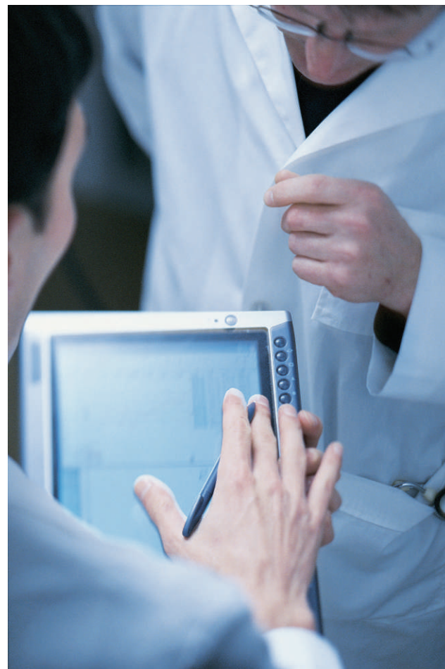
Mobile devices provide clinicians with more options to review and update patient information.

In addition, the buyer should always consider the application’s ability to facilitate workflow automation and the robustness of any workflow